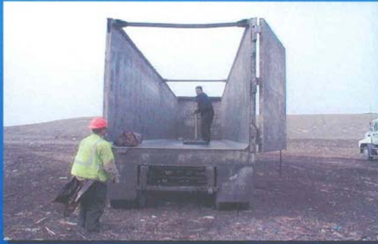
Photograph 7: Inspection and cleaning of outgoing trailer.