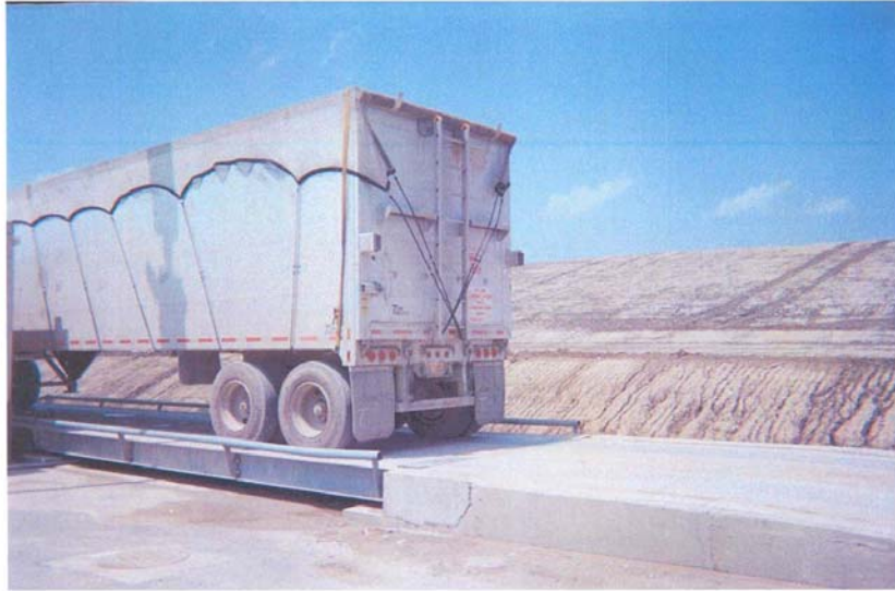
Photograph 3: Proper method of securing cover to rear of trailer. A minimum of 2 tarp straps for corners of the cover (here four are used), and a cargo strap. (Note: The cargo strap is placed over the top of the door.)