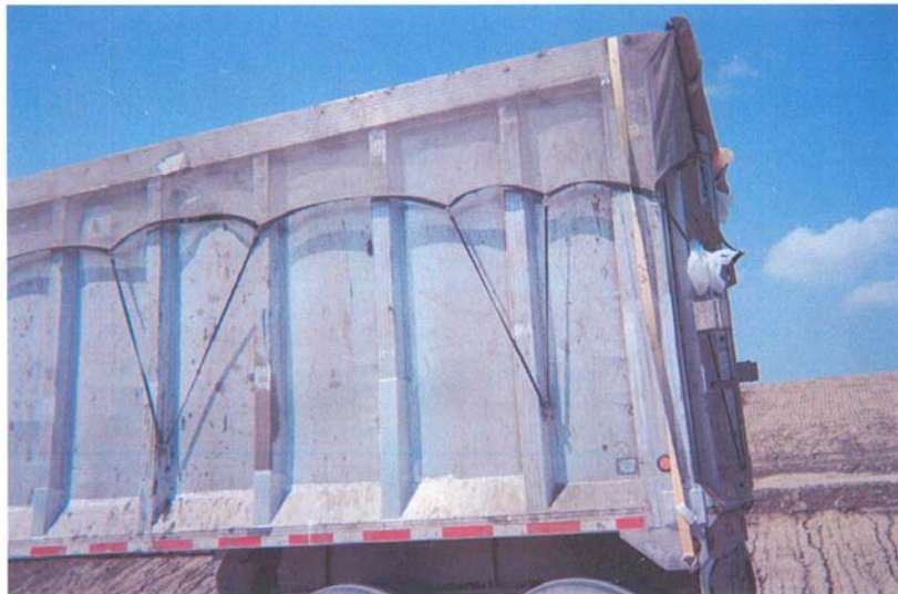
Photo No. 4: IMPROPER method of installing cargo strap. Strap should be placed over the top of the door.