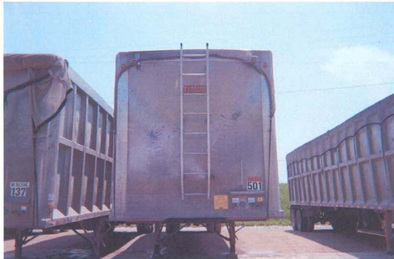
Photograph 2: Proper method of securing left and right sides of cover to front of trailer. (Note: Cover is permanently attached to trailer.)