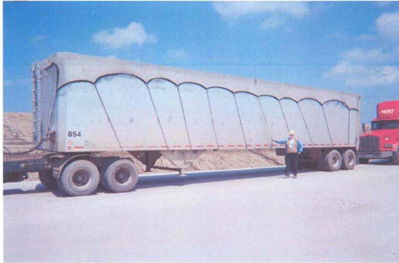
Photograph 1: Proper method of securing cover to side of trailer. Ten evenly spaced tarp straps. (Note: The cover overlaps side of the trailer a minimum of 12 inches.)